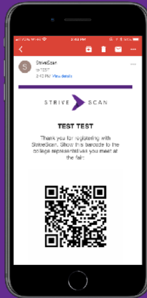
2. Email Optional: print