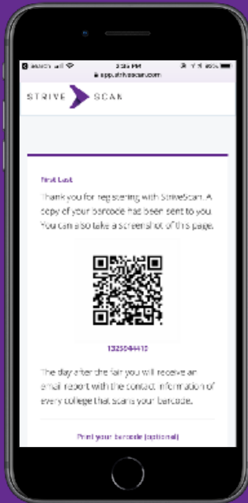
1. Webpage Optional: print