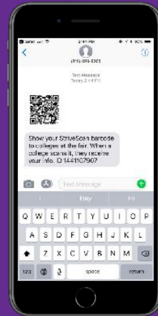
3. Text Message

2 hours before fair: Reminder barcode sent via email & text